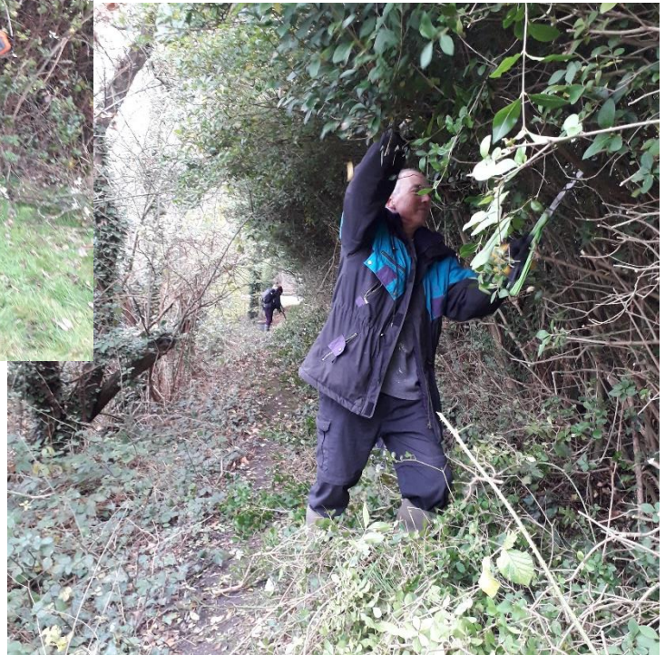
The trained path wardens using their power tools

The 1 st task of 2020 took place on Tuesday 5 th February and involved clearing vegetation from a promoted route in Netley Marsh.