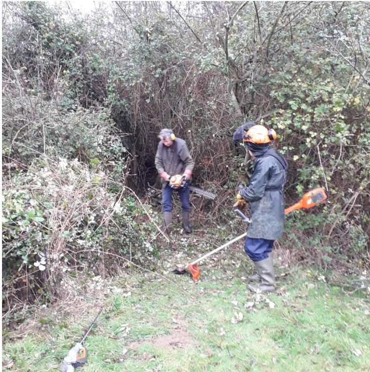
Cutting back a footpath